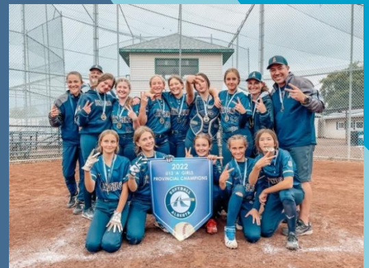
U15A 2008 Calgary, AB