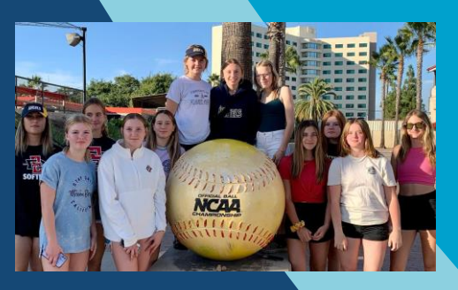
14U - SDSU Softball Stadium