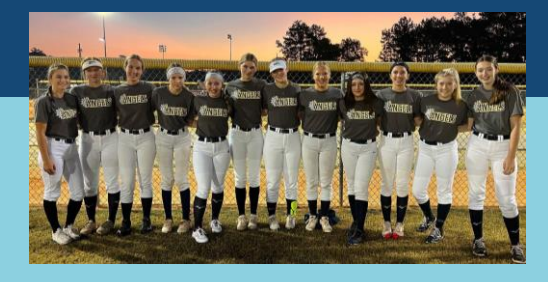
6U - SMGSL Softball Park