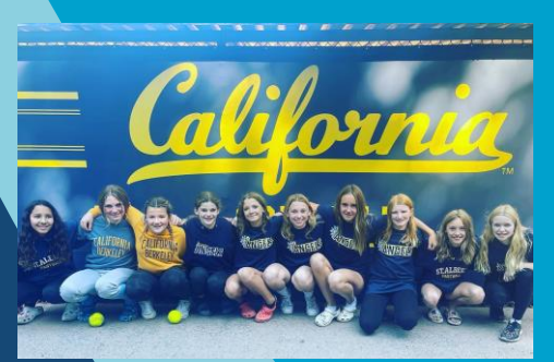
12U - University of California, Berkeley

In October these teams traveled to Sonoma, CA (12U), San Diego, CA (14U), Houston, TX (16U) and Orange County, CA (07's). These girls are having a great time competing and watching some games at the State Universities.