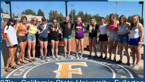
07's - California State University, Fullerton